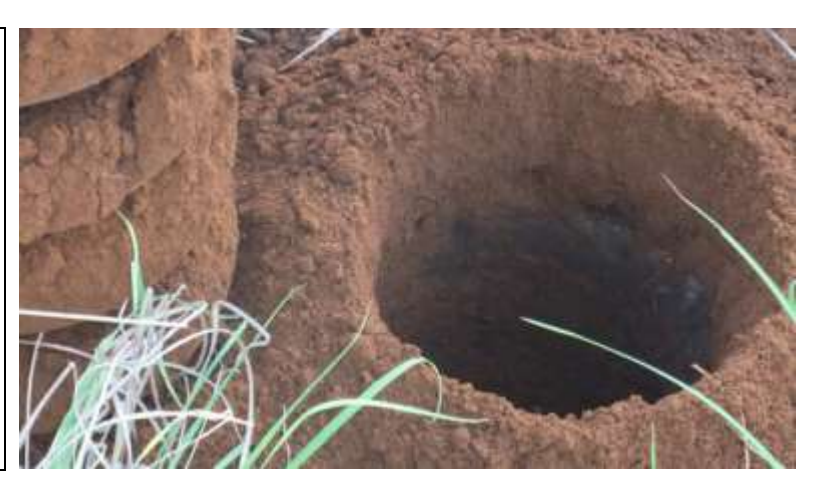
Red Soil on Kimba Plateau, west of Laura.

"Unquestionably, economic development and environmental protection must go together – we must shift from approaches that place economic development and environment at loggerheads with each other".