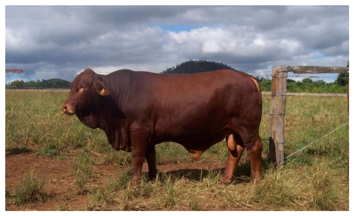
"Senemaster" (Senepol X Droughtmaster) bull at 17 months - a new composite breed for Northern Australia developed by Pinnacle Pocket Cattle.

Expanding agricultural production into new areas brings new challenges. Issues such as pest and disease control, irrigation and nutrient management, varietal suitability and selection etc. There will need to be focussed research and development programs to develop profitable production systems. The question is - who will do this research now that Government Research, Development & Extension services have been wound back?