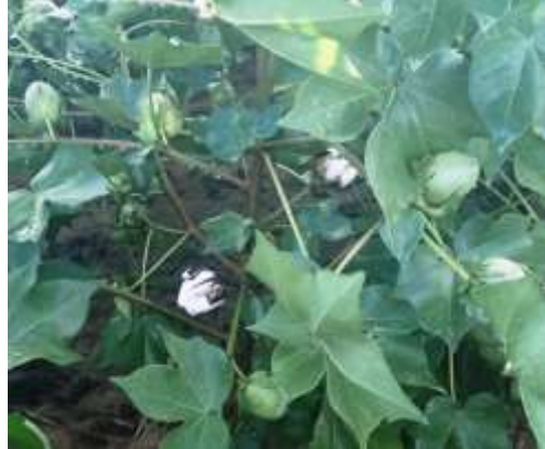
Cotton growing on the Gilbert River.

The Flinders River Agricultural Precinct presents tracts of the best farming soils in Queensland available for development. Possible crops include, but are not limited to, the production of cotton, rice, sugar, mung beans, soy beans, chick peas, maize, hay and sorghum (forage and grain). The Flinders River provides the security of a reliable water source; Water allocations from the Flinders River are currently underutilised, with an annual 3,800,000 Ml of river flow. Soils are mainly black cracking clays with some areas of basalt (black earths) and brown, sandy clay loams of lighter texture. Land is affordable in comparison to developed irrigation areas such as Burdekin and Emerald. Currently on the upper Flinders River there is 200 to 300 ha of established commercial irrigated fodder, cotton and small grains crops, demonstrating viability.