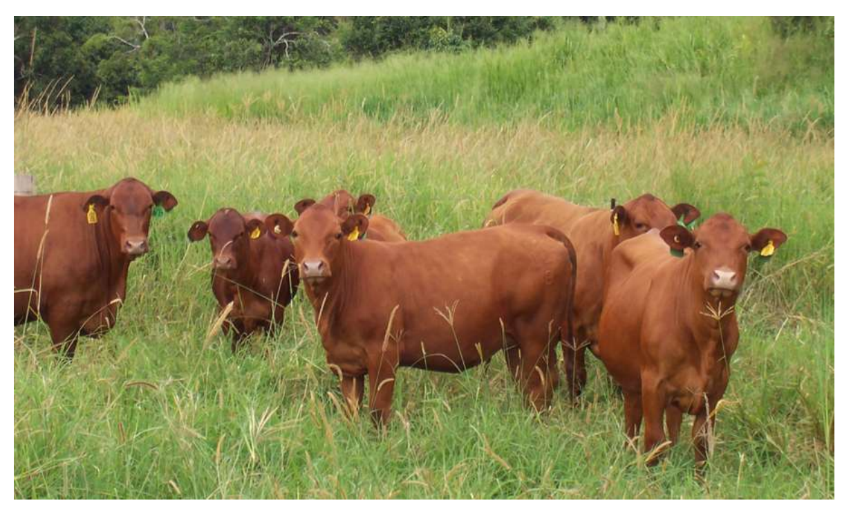
Tropical Innovation - Senepol heifers – a tropically-adapted Bos Taurus breed with high-meat quality and fertility. Naturally polled (requires no dehorning) and sleek coated.

under the Vegetation Management Act, no further clearing for grazing can occur. Expansion and sustainability rests on enhanced access to, and use of water; improved road infrastructure which allows all weather access to markets, meatworks and ports, reform of leasehold conditions (tenure), improved pasture and meat processing capability. Value adding, underpinned by capital investment, is critical for the industry's growth. There are potential trade opportunities with the Asia Pacific through live cattle and boxed beef.